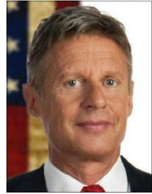
Barack Obama (D)